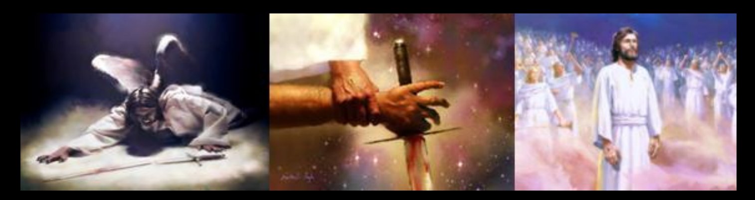
"And there was war in heaven: Michael and his angels fought against the dragon; and the dragon fought and his angels, And prevailed not; neither was their place found any more in heaven." Revelation 12:7, 8..